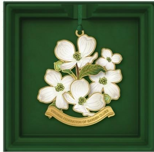
Dimensions: L to R, 2.65"; Top to Bottom, 3.05" Depth approximately .5"