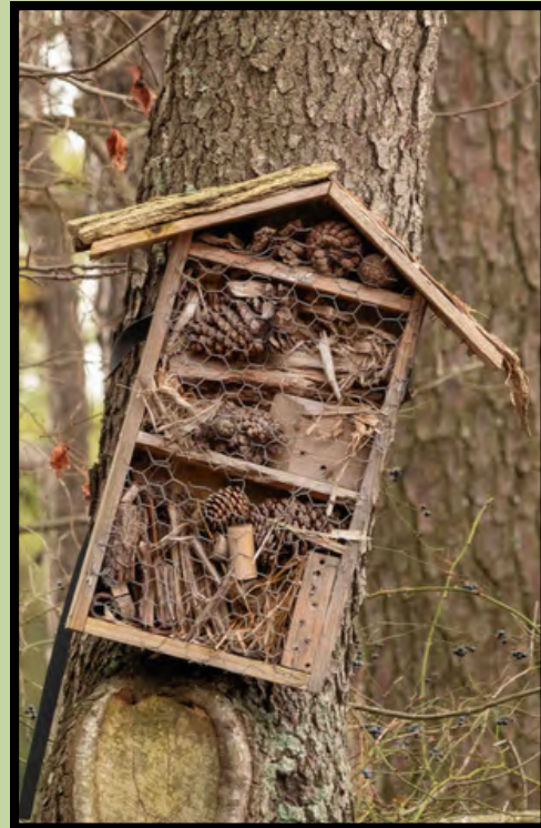
Bug Hotel, Bluebird Gap Farm Lake Smith Terrace GC (T)