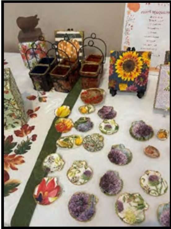
Lots going on for "Ways and Means"

On October 9, the fall Shenandoah District Meeting was held at the Bethel Lutheran Church in Winchester. The meeting was dedicated to the host clubs: Hawthorne , Colonial and Glen Burnie . Many enthusiastic members participated!