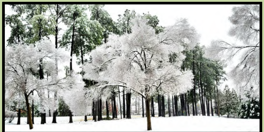
“White on Green” The woods on John Rolfe Pkwy, Henrico West Hanover GC (P)