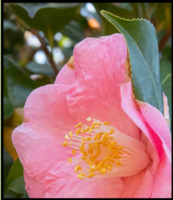
Camellia, Norfolk Botanical Garden Lake Smith Terrace GC (T)