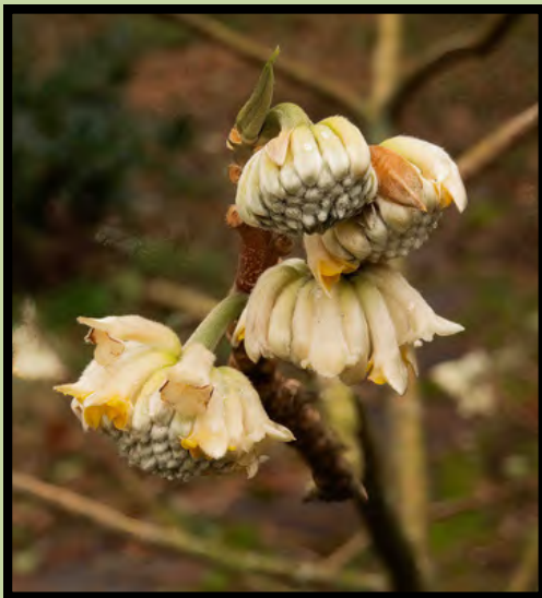
Paper Bush, Bluebird Gap Farm Lake Smith Terrace GC (T)