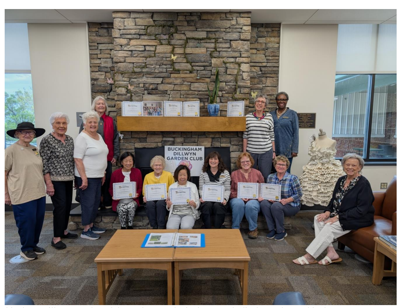
Buckingham-Dillwyn Garden Club South Central District Awards display at the Buckingham County Library