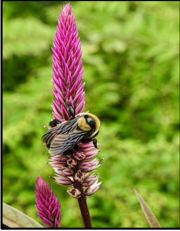
Cockscomb and Pollinator

"Summertime...and the livin' is easy..." – George Gershwin