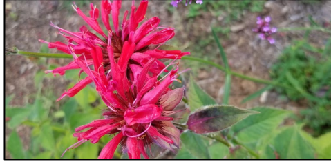
Monarda , photo by Christy Boone Blue Ridge Garden Club

Non-Profit Org. U.S. Postage Paid Permit No. 20 N. Tazewell, VA