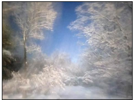
Winter Wonderland in Winchester