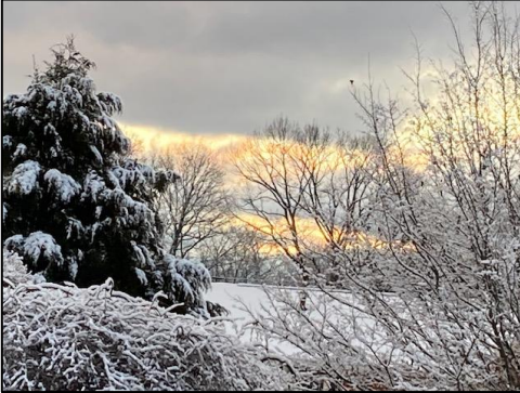
Winter Sunrise