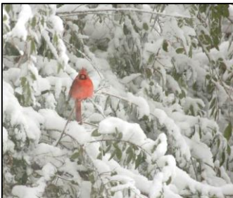
Cardinal in the Snow Photo by Joanne Wallace Salisbury GC (P)