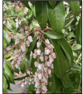
A Pieris japonica Photo by Lynne Still Thomas Jefferson GC (P)