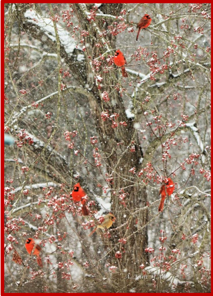
Cardinals in the Snow