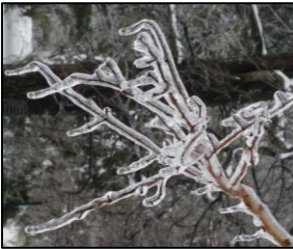
Ice on Dogwood Branch