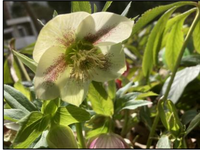
Helleborus Lynne January, Thomas Jefferson GC (P)

Non-Profit Org. U.S. Postage Paid Permit No. 20 N. Tazewell, VA