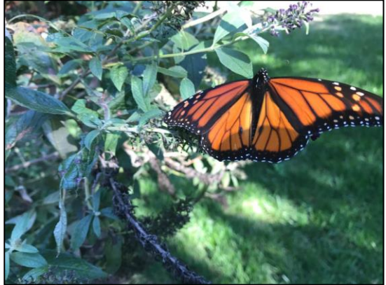
"Feasting Monarch" Photo by Dana Dee Salisbury GC (P)