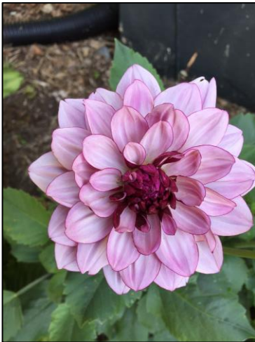
Perfect Dahlia Photo by Lynn Leech Lexington GC (S)