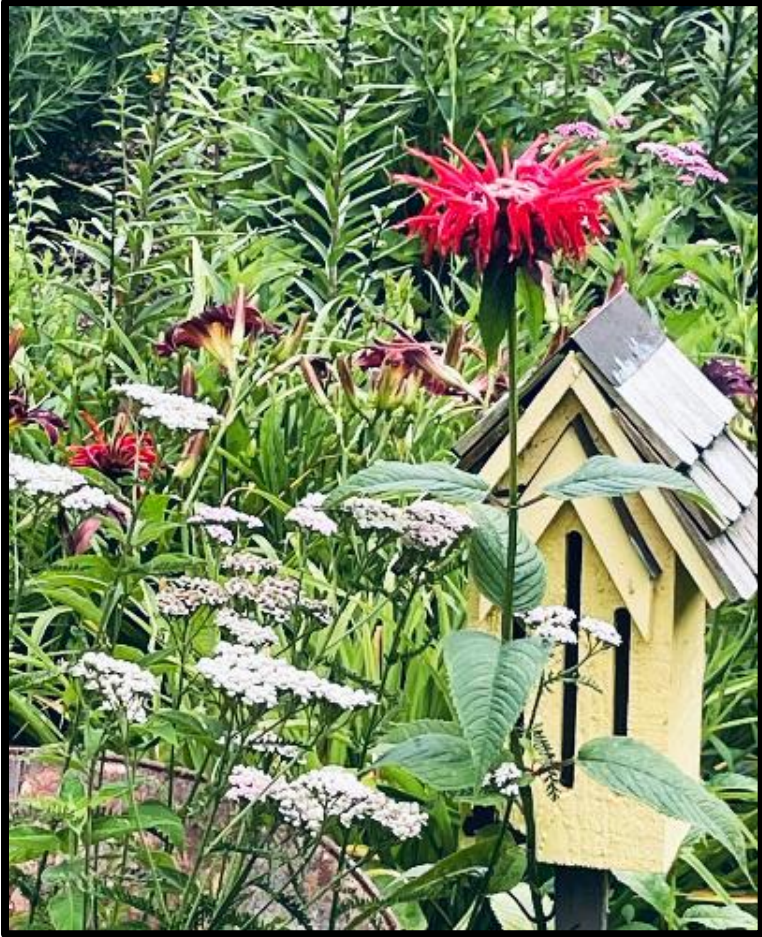
Fairies Delight...a Magical Summer Garden, Richmond

www.viriniagardenclubs.org Summer 2022 • Volume 54 • No. 1