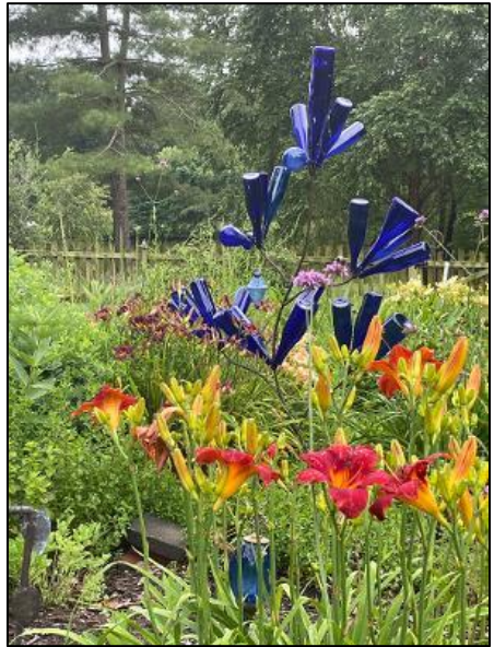
Mid-summer Glory