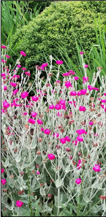
Rose campion Photo by Christy Boone Blue Ridge GC (BR)