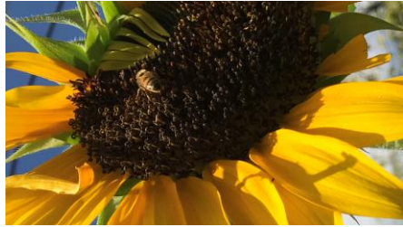
"Sunflower and Honeybee" Photo by Sandy Yun Town & Country of Wise GC (SW)