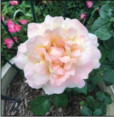
"First blush of summer..."

"So, plant your own gardens and decorate your own soul, instead of waiting for someone to bring you flowers." – Jorge Luis Borges