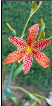
Blackberry Lily Photo by Christy Boone Blue Ridge GC (BR)