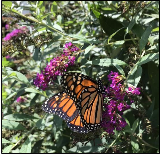
"Opposites attract..." Town & Country GC, Wise (SW)