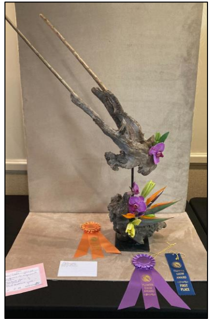
Amy Gable Thorpe Award of Design Excellence and Designer's Choice Award