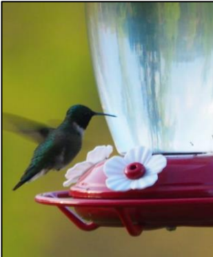
Hummingbird in action... Photo by Karen DeBord Moneta GC (BR)