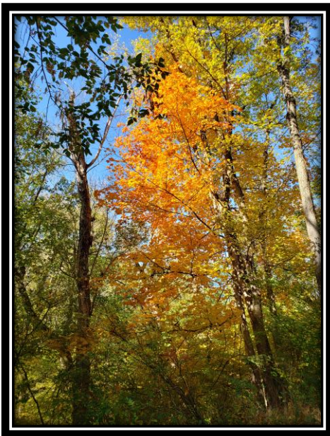
Autumn Scene By Adele Lundquist Lynnhaven Heritage GC (T)