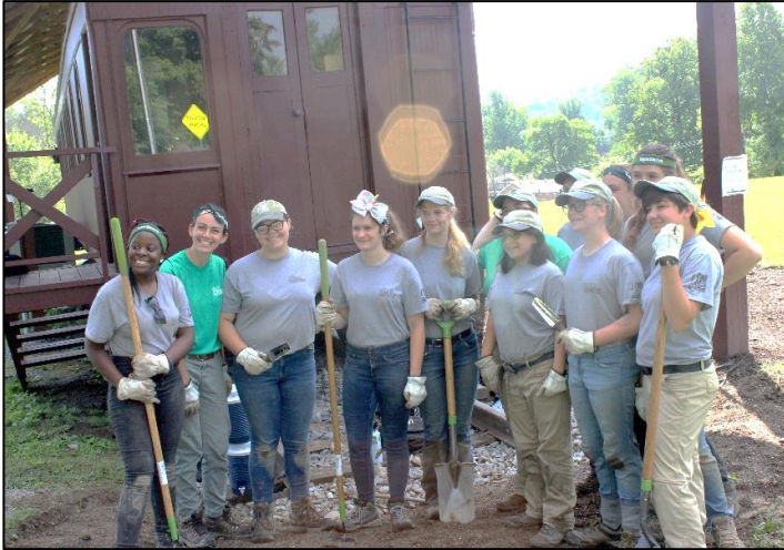
Virginia Conservation Corp Members

winterberry. Green Thumb planted milkweed and zinnia seeds in the greenhouse with assistance from students at Norton Elementary and Middle Schools. These were transplanted into the gardens with help from members, museum staff, and the Youth Conservation Corps.