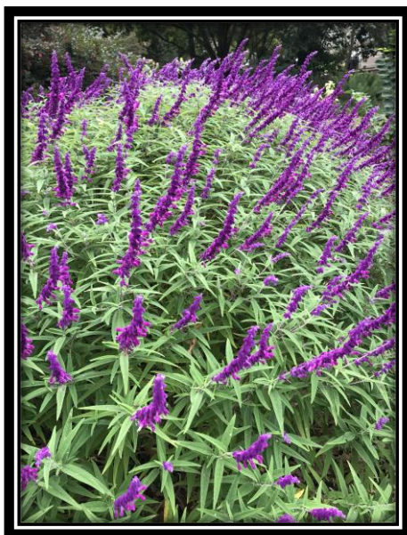
October Brilliance of Mexican bush sage (Salvia leucantha).