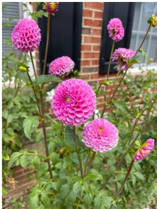
Dahlia pictures