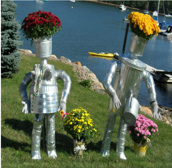
Upper left: Flower People: Nova Scotia