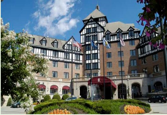
Hotel Roanoke and Conference Center

SAVE THE DATE South Atlantic Region 61 st Annual Convention March 5-7, 2023 “Celebrating Our Region Connections”