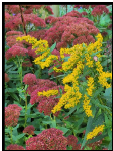
Sedum x 'Autumn Joy' Hylotelephium