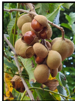
Ohio Buckeye hanging in its pods from the tree.