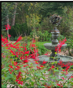
Pineapple sage, Salvia elegans , in the Herb Garden