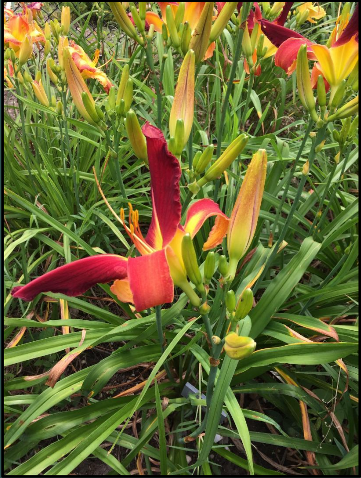
Daylily Cultivar 'Red Suspenders' Judy Durant's garden in Hanover County