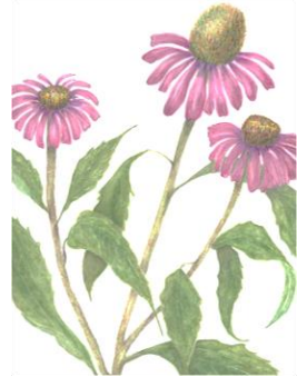
Low water need plant: Coneflower Rudbeckia . ©ggh

Plants with low-water needs are coneflower, artemisia, lambs’ ear, Russian sage, butterfly bush, hardy geranium, sedum, epimedium, and grasses like miscanthus and pennisetum. Keep in mind that native plants require less water and fertilizer. Remember too that taller grass is more drought tolerant, so be sure to raise your mower an inch higher.