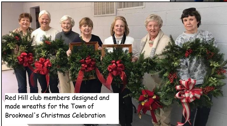
Red Hill club members designed and made wreaths for the Town of Brookneal's Christmas Celebration