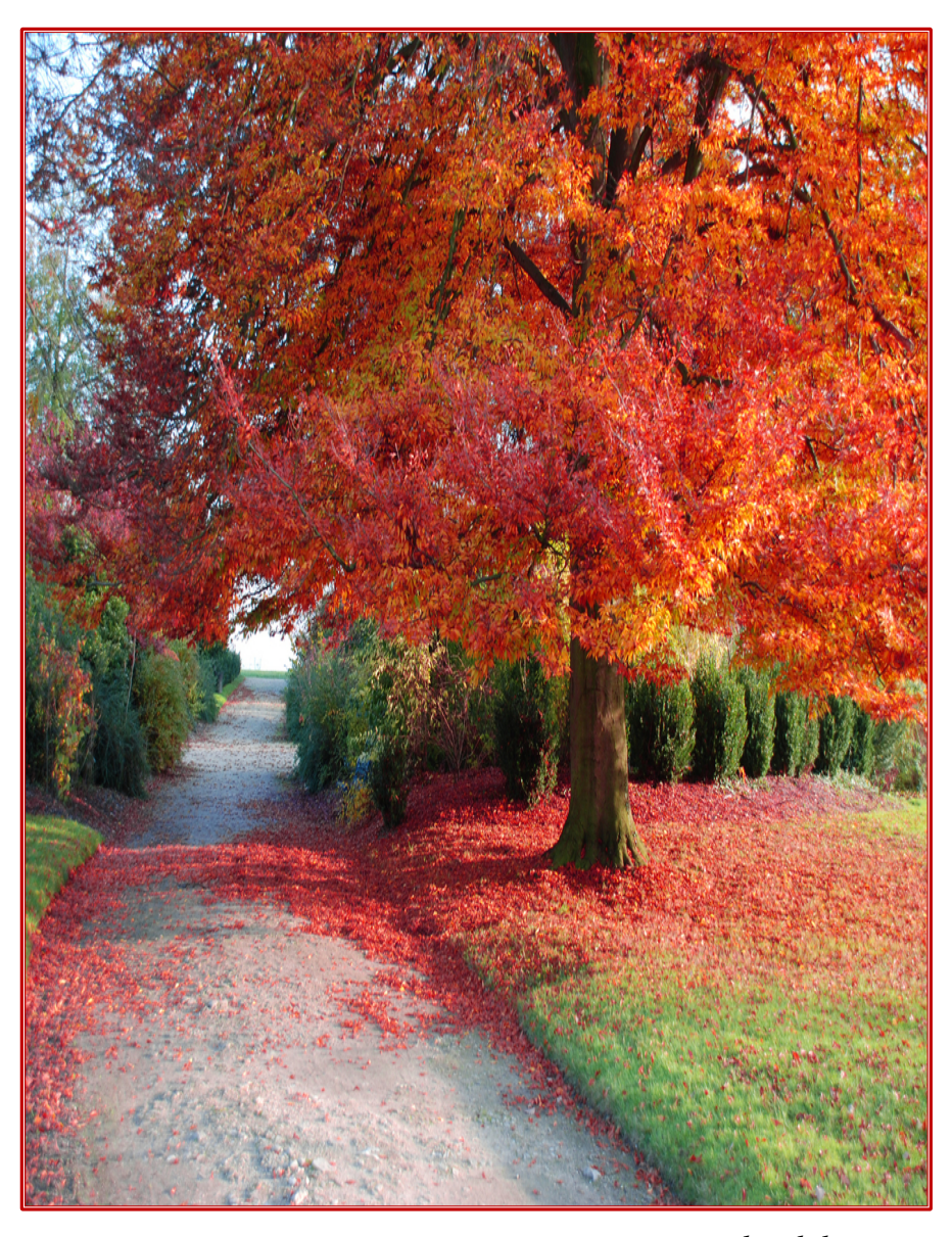
www.virginiagardenclubs.org Fall 2019 • Volume 51 • No. 2